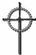
St Mary's, Olveston