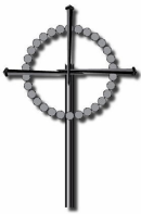
St Mary's, Olveston

We need personnel to co-ordinate groups with similar interests, and represent them on a planning committee. E.g. someone to represent the Sports clubs, another for Service organisations, Churches, PTAs, Floral groups, and so on. We will need someone to co-ordinate stage/arena events, another to plan a procession if there is to be one. These need not be tasks for just a single person. It might be that a club takes on this role, or that a social working group convenes for the purpose of taking a given part of the organisation forward."