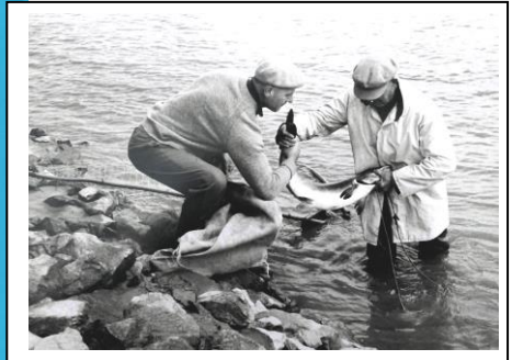
‘The Glorious Uncertainty - Salmon Fishing in the River

In association with Thornbury & District Museum