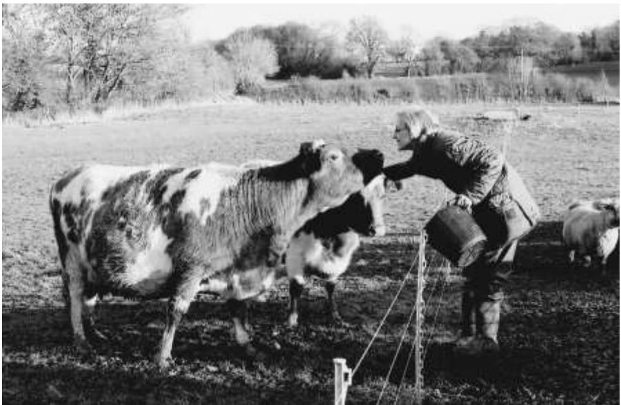
Jules with Imogen

With Simon working full time, Jules manages this smallholding pretty much single-handed, but she is very energetic and busy and there will be many more interesting developments to come in the future.