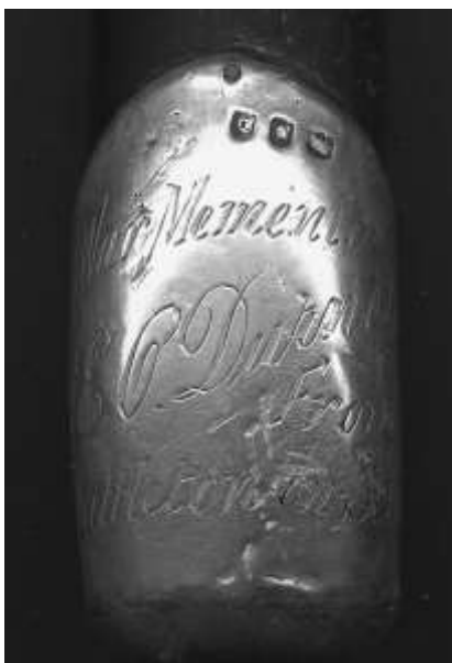
His engraved walking stick