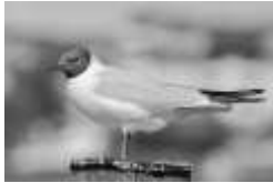
Black headed gull

We'll start with the most common gull that we see; the Black-Headed gull. That's the one that has a chocolate brown head only for the length of the breeding season and then loses it. What we see then is a white headed gull with only a black comma behind its eye. Best things to look for are its cherry red legs and bill and its smaller size. It's the one that steals the bread when you are trying to feed the ducks.