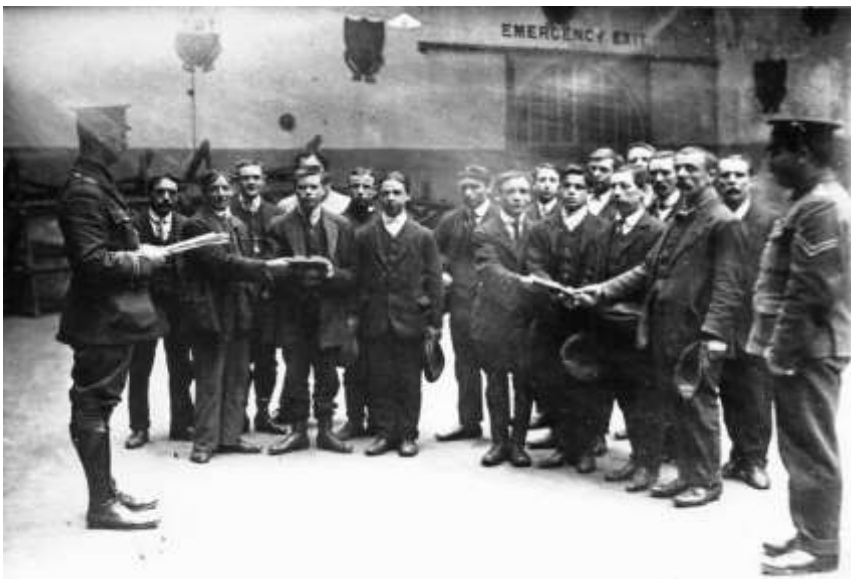
Taking the King's shilling – Bristol 1914

Some people had known that war was inevitable for months, but hostilities arguably began in Sarajevo on the 28 th of June 1914, with the shooting of Archduke Franz Ferdinand. This was reported as an outrage by Gloucestershire newspapers, although reassuringly courteous notes between nations were exchanged to avert any crisis. Then increasingly disturbing world events were chronicled, resulting in demands being issued.