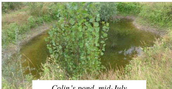
Colin's pond, mid-July

Starting out, Colin realised that the biggest issue would be water, and he dug a huge pond, along with an impressive underground network of drains feeding it with rainwater. He pumps water from this into a series of tanks which he uses in various ways - to fill watering cans, to mix with sheep manure, to soak comfrey for compost etc. (Vast quantities of comfrey are being grown everywhere you look: it is vital to the quality of his otherwise clay-based soil.)