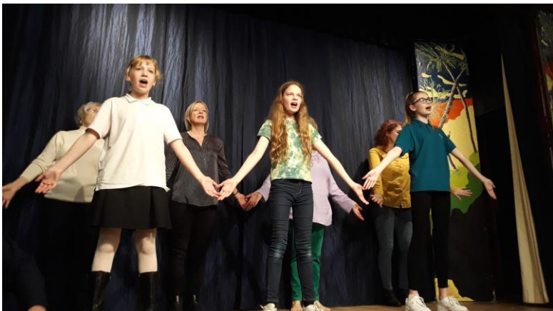
Cast members rehearsing in the Parish Hall

The show's engaging mix of comedy and tragedy, together with the famous and much-loved score, make this a musical that you can watch time and time again without tiring. 'There is Nothin' like a Dame', 'Some Enchanted Evening', 'Bali Ha'i' and 'I'm Gonna Wash That Man Right Outa My Hair' are just a few of the memorable songs.