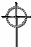
St Mary's, Olveston

The exhibition, along with the rest of the museum, is open from 1pm to 4pm, Tuesday to Friday , and from 10am to 4pm on Saturdays . The museum is in Chapel St, next to the Wheatsheaf pub and opposite the St. Mary's St. Car Park. Come along and experience the festival spirit!