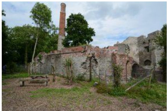
Brandy Bottom Colliery